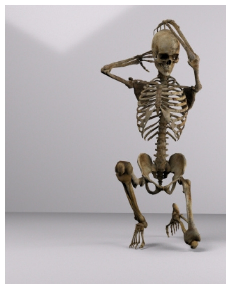
With a fixed mindset, we never flesh out the full potential of our talents.

With a growth mindset, others' success does not eclipse my light but instead amplifies it. Their rising tide lifts my boat as well. Folks in this frame thrive when given the opportunity to test limits and to find new abilities. In the end, driven by a greater sense of agency or free will, they iterate onward, reaching ever higher levels of achievement.