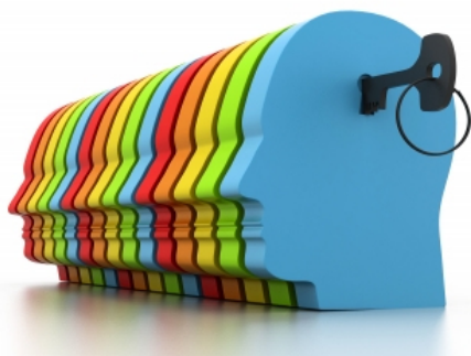
Building a growth mindset unlocks all sorts of possibilities.

GROWTH MINDSET: “If I don’t take responsibility, I can’t fix it. Let me listen—however painful it is—and learn whatever I can.” [2]